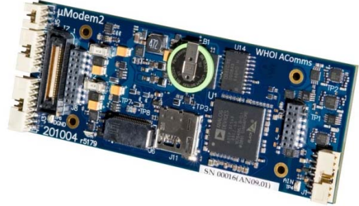
Figure 1. The 4.5" x 1.75" Micromodem-2 preserves the physical form factor of the Micromodem-1 while providing improved expansion connectors and I/O capabilities.

Navigation features included in the original development phase included compatibility with REMUS broadband transponders to allow a vehicle to operate in a REMUS navigation network, and narrow-band transponder compatibility that supports many commercially-available deep and shallow-water transponders [4]. These features made it easier to add both acoustic communications and navigation to small vehicles by integrating these functions into one subsystem and transducer.